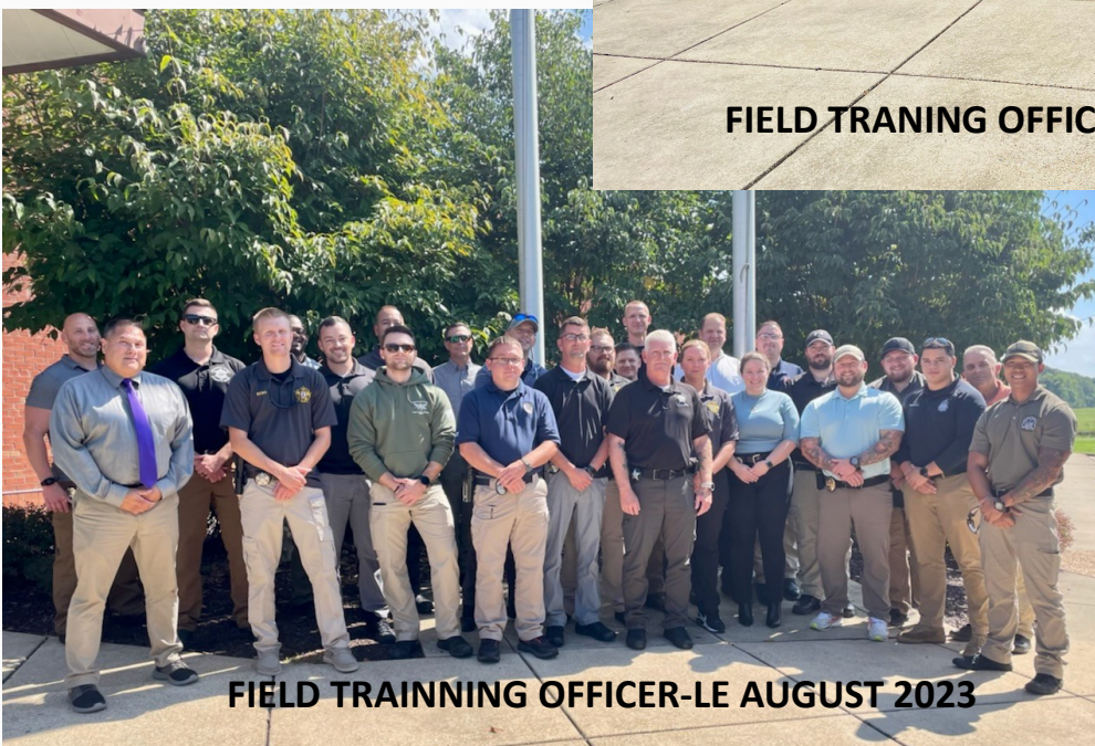
FIELD TRAINING OFFICER-LE AUGUST 2023