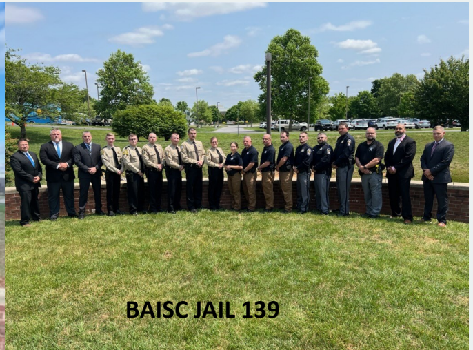
BASIC JAIL 139