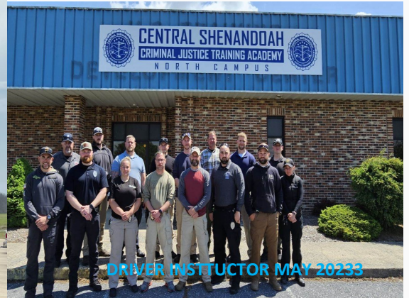
DRIVER INSTRUCTOR MAY 2023