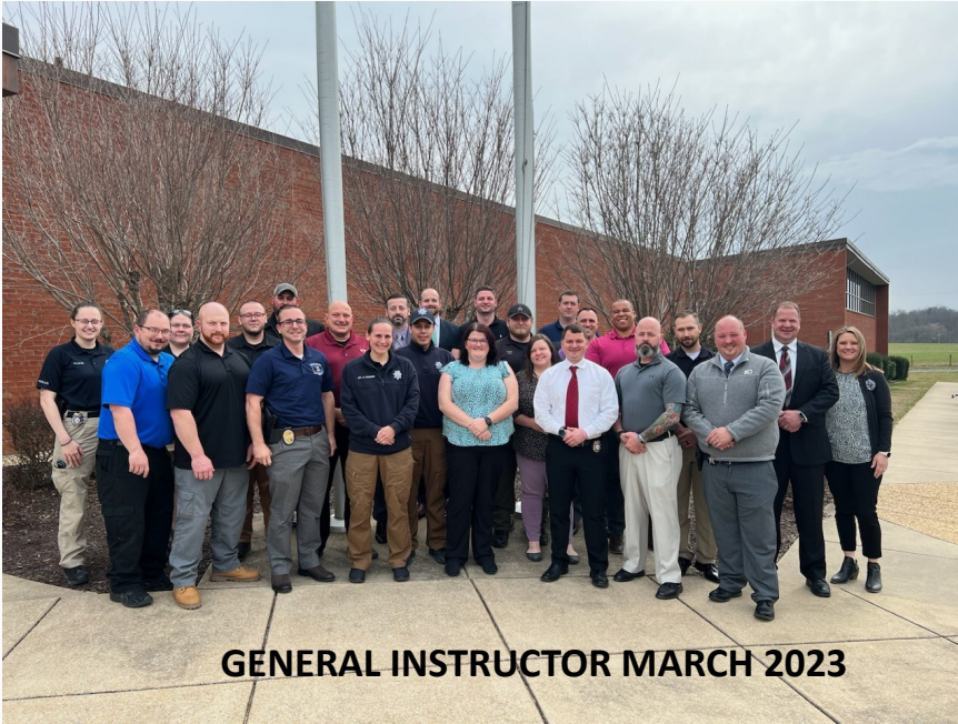
GENERAL INSTRUCTOR MARCH 2023