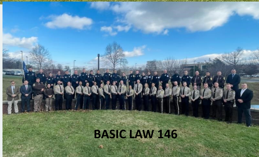
BASIC LAW 146