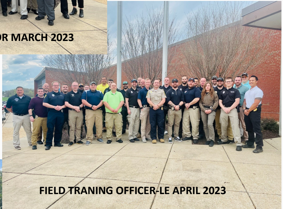
FIELD TRAINING OFFICER-LE APRIL 2023