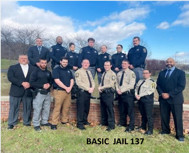
BASIC JAIL 137