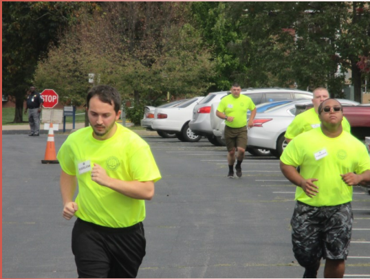
PT Assessment 1 1/2 Mile Run