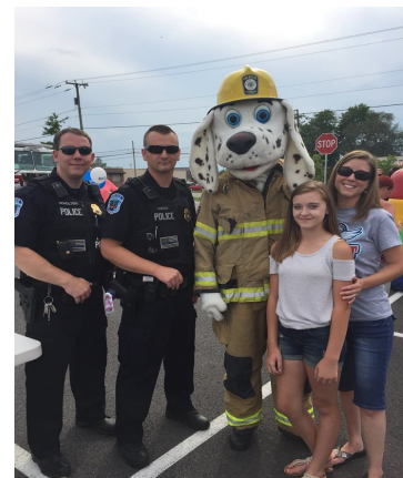
National Night Out August 1, 2017