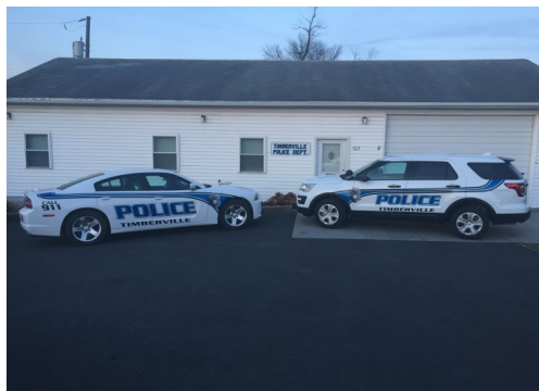
Timberville Police Department